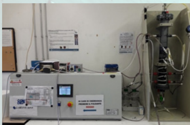
Figure 1 – SBR reactor (on the right) and control unit (on the left).